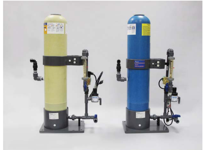
Figure 1 — Dual Solid Biocide Feed System

Pre-assembled inlet and outlet plumbing modules, and quick-connect tubing fittings cut installation time down to only minutes. Although designed as a dual solid biocide system, each feeder module can also be used independently.