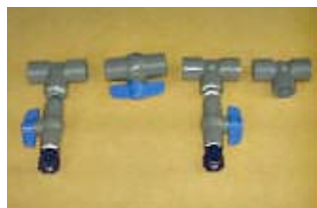
Dual Manifold Kit

The two feeders are installed on the side stream of the cooling tower recirculation loop. Valves mounted on the side stream divert a controlled amount of flow through the system (valves provided in optional Dual Manifold Kit). A single line can be used to supply drive water to both feeders. Additionally, both discharges can be combined into a single line. This greatly simplifies installation. (see Installation diagram).