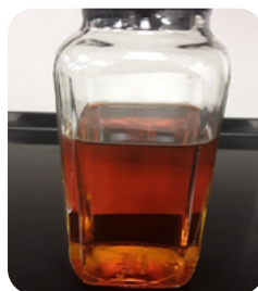
Treated with Nalco Water Solutions