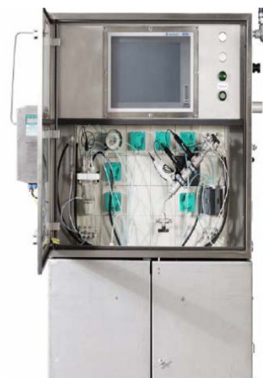
FIGURE 1: 3D TRASAR FOR CRUDE OVERHEAD SYSTEMS EQUIPMENT

overhead events identified by the 3D TRASAR Technology for COS (denoted by the blue circles in Figure 2). Caustic flow rate reduction was the result of pump mechanical issues, which stopped caustic flow during short-term pressure fluctuations. A mechanical survey performed on the desalter identified mud wash piping and operational differences between desalter trains as the root cause for the pressure fluctuations.